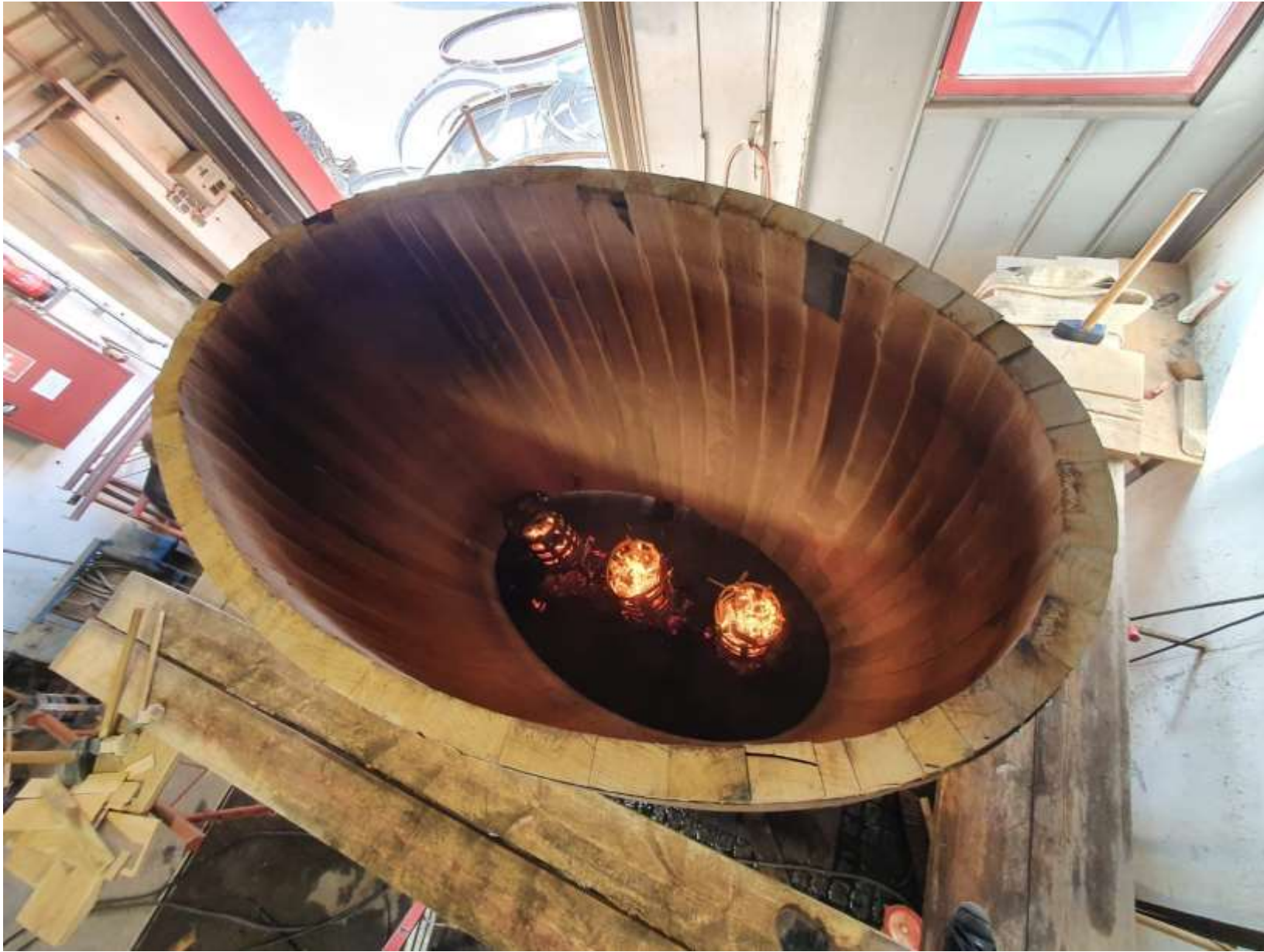
MAKING OF THE BIG BARREL BY PAUSCHA IN THE TRADITIONAL WAY WITH FIRE