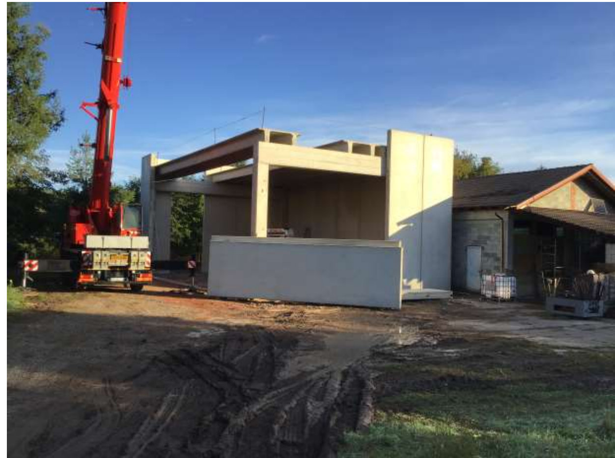
BUILDING WAREHOUSE AND RENOVATE AGRICENTRE