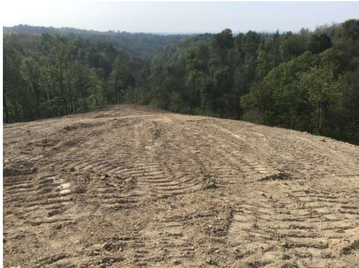
New vineyard in Traversagna: Mottornovo site – cut put from the forest.