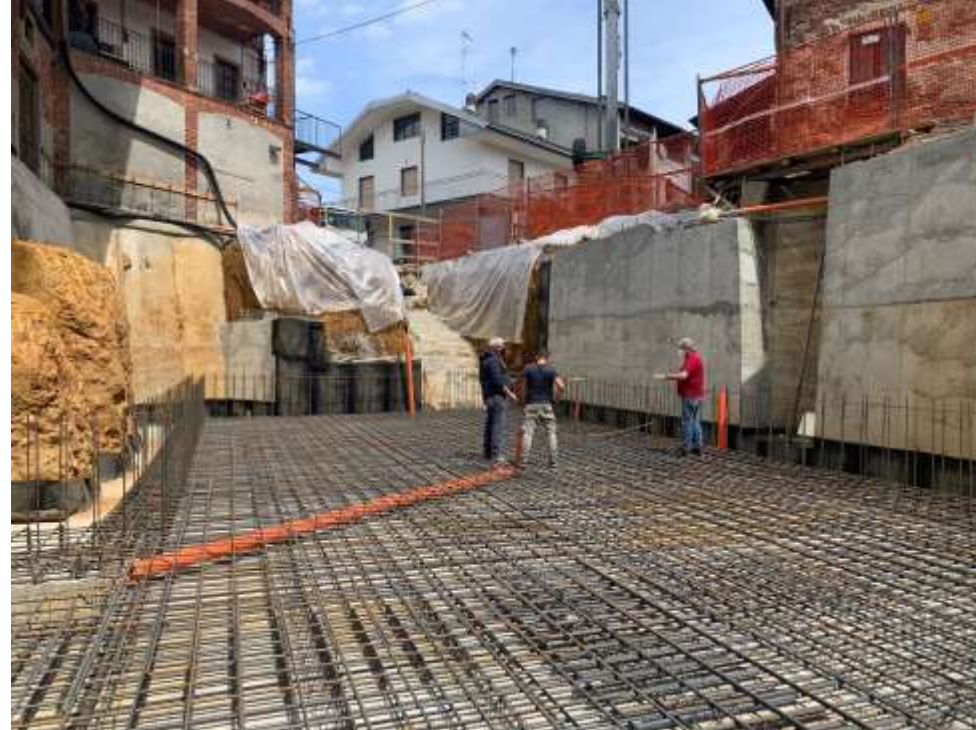
BUILDING THE NEW CELLAR